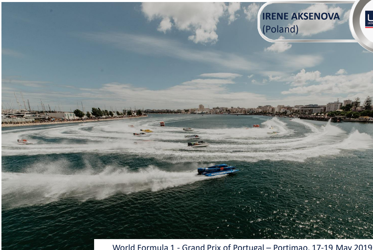
World Formula 1 - Grand Prix of Portugal – Portimao, 17-19 May 2019