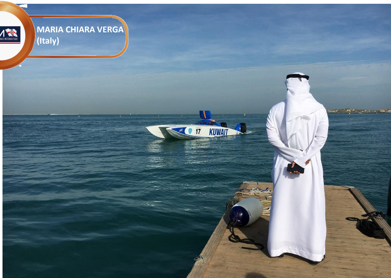
Offshore World – XCAT World Championship Grand Prix of UAE, Dubai - 12 -14 December 2019