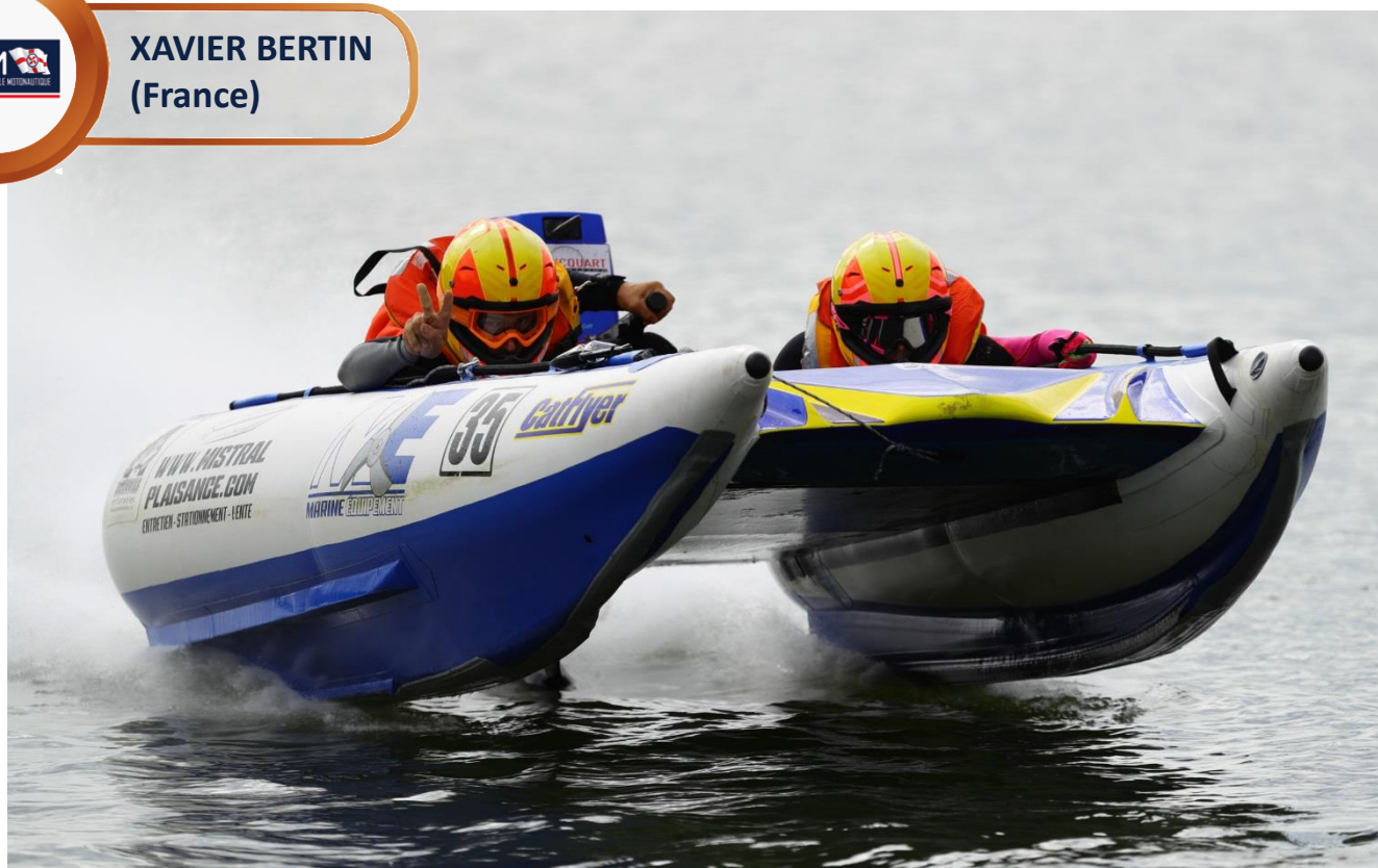
Thundercat National Championship, France, Seurre – 31 August-1 September 2019