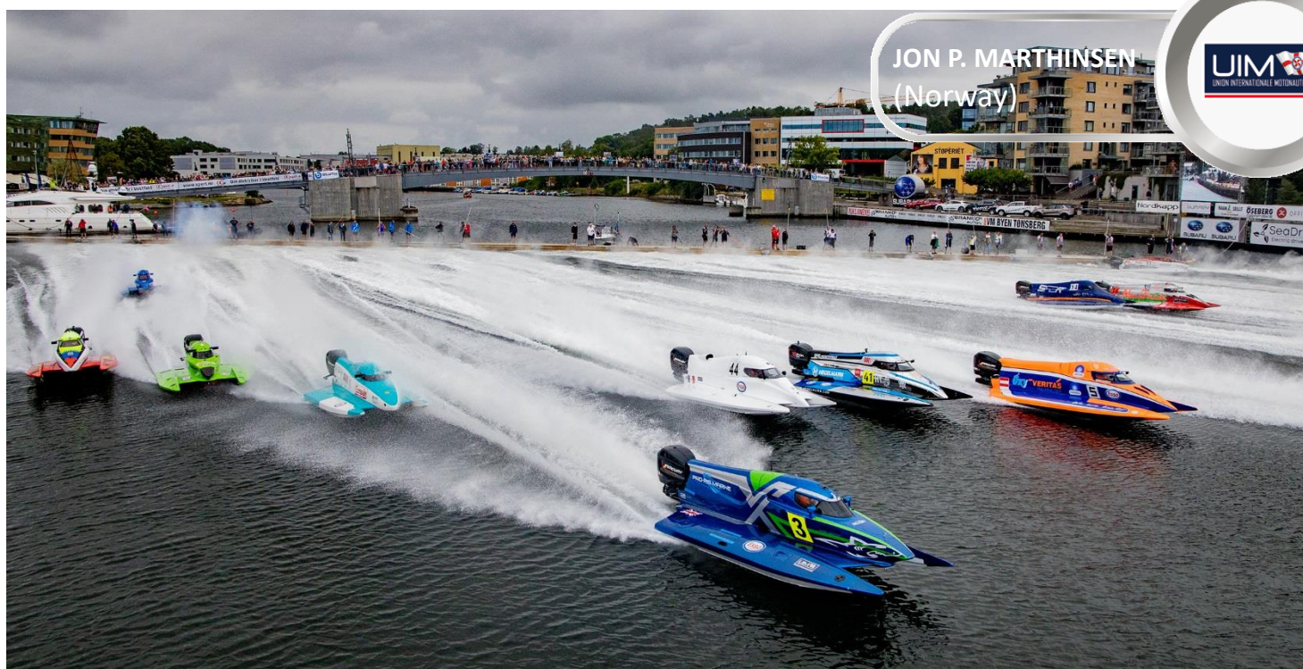
World Formula 2 - Grand Prix of Norway – Tonsberg, 2-4 August 2019