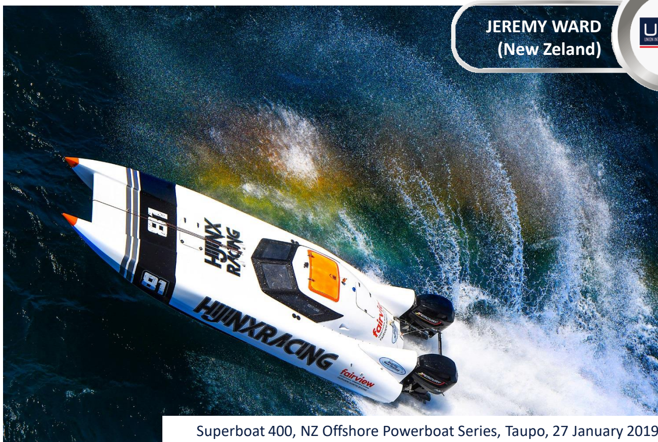
Superboat 400, NZ Offshore Powerboat Series, Taupo, 27 January 2019