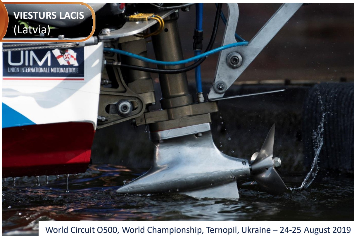
World Circuit O500, World Championship, Ternopil, Ukraine – 24-25 August 2019