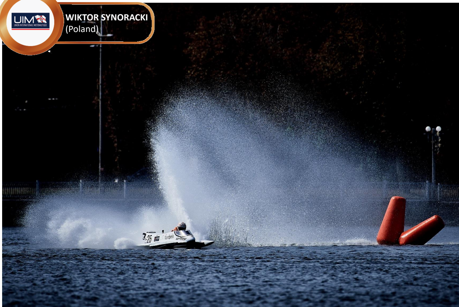
Circuit Formula World – Hydro GP of Ukraine, Ternopil – 24-25 September 2019